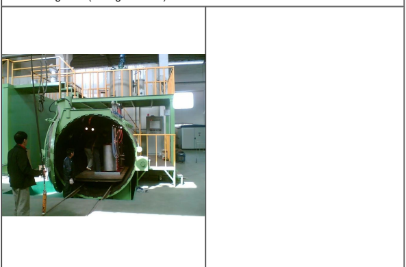
500L mixing tank (750kg material)