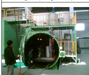
500L mixing tank (750kg material)