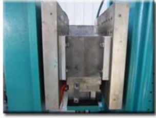
Step 1: Installing and heating mold