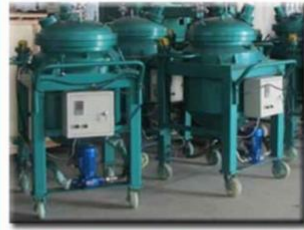
Step 2: Mixing and vacuumize resin