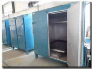
Step 4: Curing in oven

Arm Bushing/Insulation casting pipe series, Conjoined Insulator series, Casting seat series