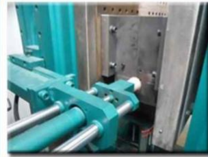
Step 3: Adding pressure and injection materials into mold