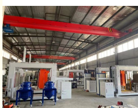
Double-station APG Clamping Machine