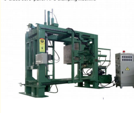
6-sides core-puller APG Clamping Machine