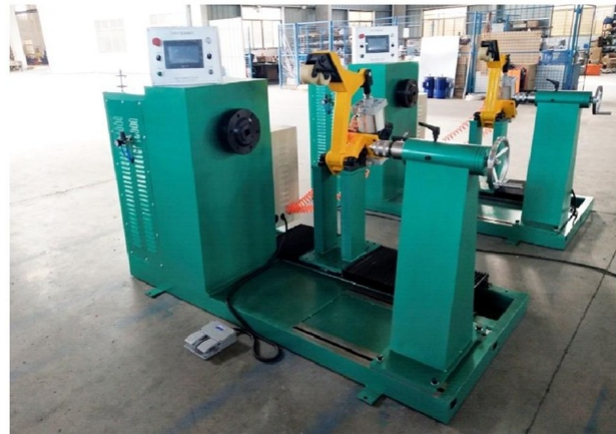
JC-1T/2T series high and low pressure winding machine