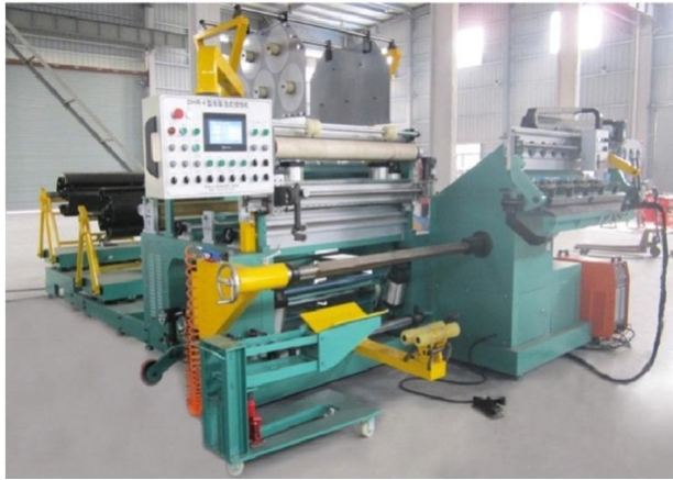
2014 Type JC-4-1400S Model double-layer layer foil winding machine