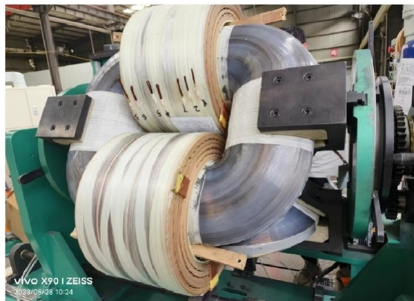
Amorphous triangular coil core