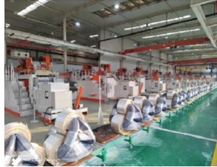
JC-5-80 Economical triangular three-dimensional coiling core high and low pressure integrated winding machine

The utility model relates to an automatic and intelligent multi-function winding product which is specially used for winding the core coil of amorphous (silicon steel) triangular coiling core transformer. Suitable for 50KVA-630KVA amorphous (silicon steel) triangular coil core transformer low-voltage foil coil and high-voltage coil production.