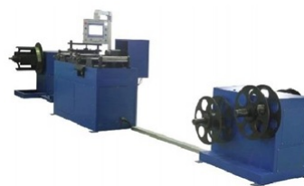
DHR-1T/2T Self-impacted low-voltage winding machine