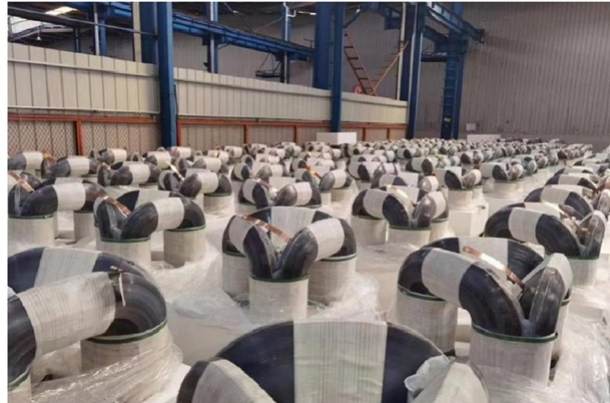
JC-6-630 Intelligent high pressure automatic winding machine

· Features: Low loss, low noise, low current (Level 1 energy efficiency)