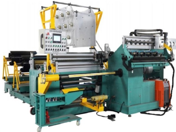
JC-800/1000 High pressure automatic winding machine