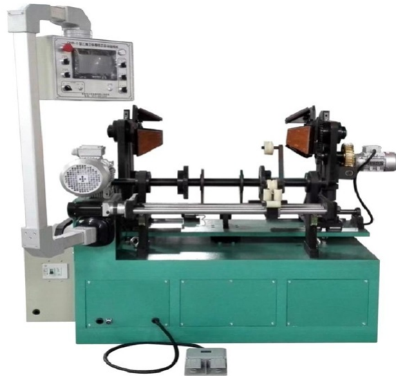
DHR-5 triangle stereoscopic reel-iron-core automatic winding machine