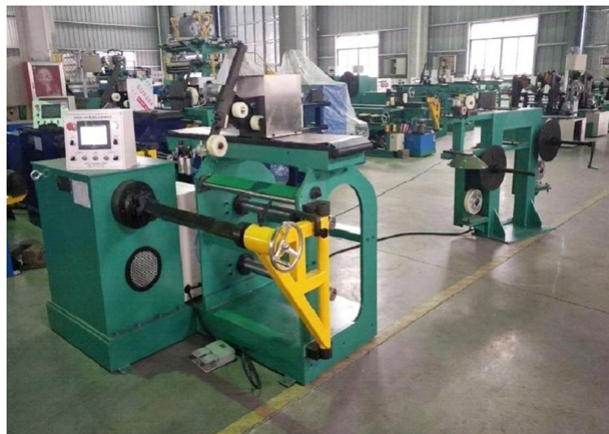
JC5-800/2500 Type triangular tridimensional toroidal-core automatic winding machine